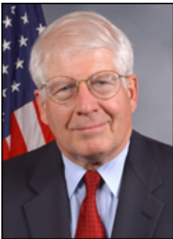
Congressman David Price